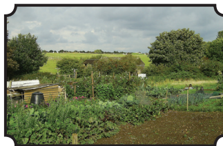
Photo right of one of the allotment plots.

Email: pottontowncouncilbookings@btconnect.com or Tel: 260086 about being added to the allotment waiting list.