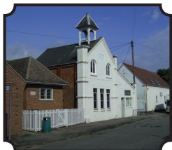
Photo of Mill Lane Pavilion and the Community Centre.

The Pavilion at Mill Lane has a large 9 metre square hall and kitchen and there are facilities for people with disabilities. The floor may not be suitable for dance groups. We have a large free to use car park.