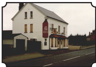
Photo right of The Red Lion 1993 supplied by Potton History Society.

CBC has until 31st December 2014 to make a judgement about whether the asset meets the definition for listing and respond in writing to the community group. A building is deemed to be of community value if in the opinion of CBC it is currently used to further the social wellbeing or social interests of the local community; and it is realistic to think it will continue to do so in the future (whether or not in the same way). The full definition for listing is contained in Section 88 of the Act, which can be accessed via the following link: http://www.legislation.gov.uk/ukpga/2011/20/section/88/enacted .