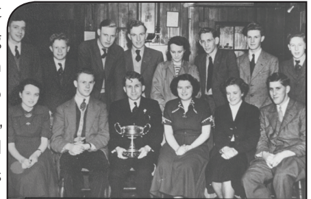
Winners of the Rose Bowl