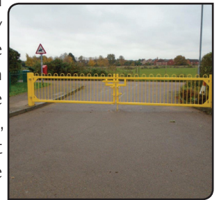
One such suggestion was to install a gate at Mill Lane Pavilion as pictured.

We, as a council, believe that we represent the population of Potton in a fair and even manner and respond positively to correspondence and suggestions from the public. We are always willing to listen to new ideas and constructive criticism when it arises. No-one can be right all the time and if we are not aware of certain subjects we cannot address them, however the town council does not respond to and will not acknowledge anonymous communications whatever the subject or delivery method.