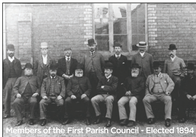
Members of the First Parish Council - Elected 1894

The Crest was refurbished earlier this year.