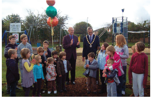
The Opening Ceremony for the new play Equipment at Henry Smith Playing Field