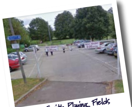
Henry Smith Playing Fields Car Park

I'll move on to the subject of development and start with some good news. Our Market Town Regeneration requests for various initiatives around the town square will finally start to move forward. Some of our traders will be investing in new shop fronts and livery whilst the town council will hopefully start work on extending the Henry Smith Playing Fields car park. Our planning application for the car park extension was recently approved by Central Bedfordshire Council (CBC) and we will shortly be going out to tender to find a company to do the work.