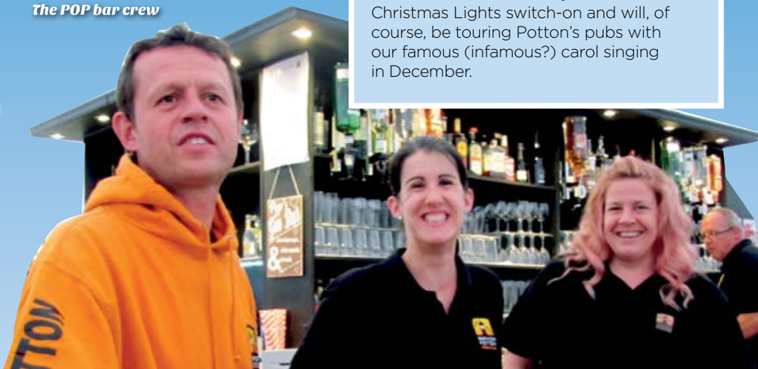
The POP bar crew

The POP Committee would like to thank the wonderful people of Potton who came along to support us and especially our magnificent volunteers, without whom we could not put on an event of this size. We're having a rest for a few weeks, but we'll see you all at the Christmas Lights switch-on and will, of course, be touring Potton's pubs with our famous (infamous?) carol singing in December.