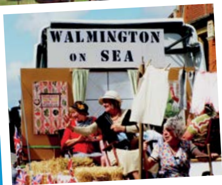
Carnival - History Society