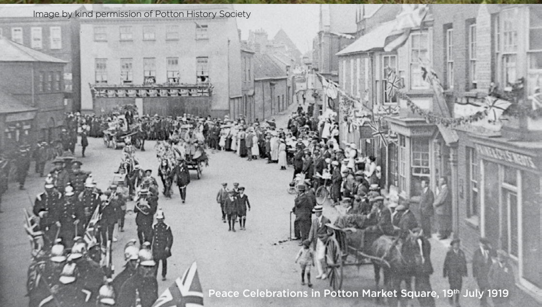
Peace Celebrations in Potton Market Square, 19 th July 1919