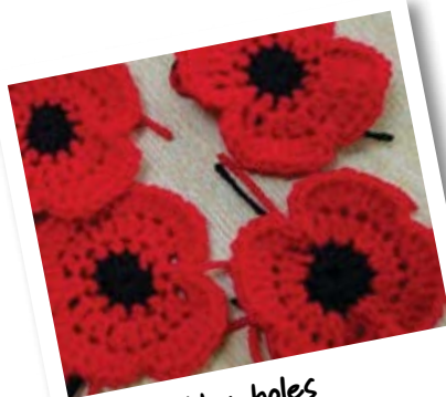
Poppy button holes

Craft & Chatter meets at 7:30pm every Friday at St Mary's Church Hall, Hatley Road, Potton.