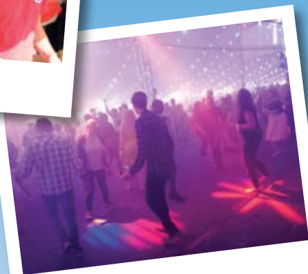
Friday night Disco