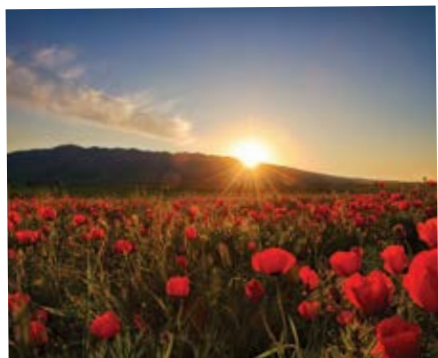
Field of poppies

This year marks the 100th anniversary of the end of the First World War. There are a number of commemorative events being organised nationally and Potton will participate in some of these. Residents will start to see Tommies appearing in the town as we mark this anniversary and raise awareness.