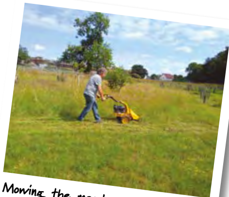
Mowing the meadow grass

If you would like to find out more, contact Potton Community Orchard Group on 01767 262258 .