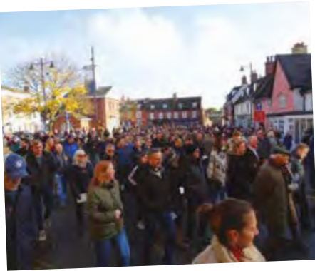
Remembrance Day 2019