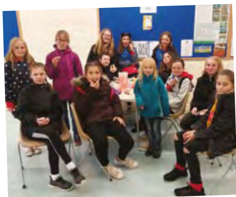
A well earned break after the Autumn litter pick

The Town Council has also been debating funding requirements over the last few months and reached agreement in January on its annual budget for the financial year 2020/2021. If you live in a Potton Band D property, you will pay an annual charge of £138.77 to Potton Town Council. See page 8 for more details about the budget.