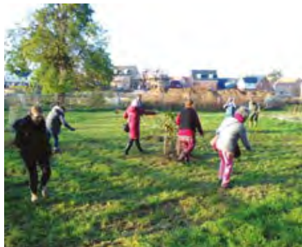
Volunteers sowing wildflower seeds

While the trees take some looking after (weeding and watering in the summer), most of the volunteers' time has been involved in restoring the meadow beneath the trees. Growing an abundance of wildflowers in the orchard helps attract wild pollinators such as bumblebees, solitary bees, butterflies, moths and hoverflies, vital in helping pollinate the trees and without whom there would be no fruit. A really healthy orchard has a good variety and balance of wildlife. So it's important to provide all with the right conditions for them to find food, shelter and somewhere safe to breed and complete their lifecycles.