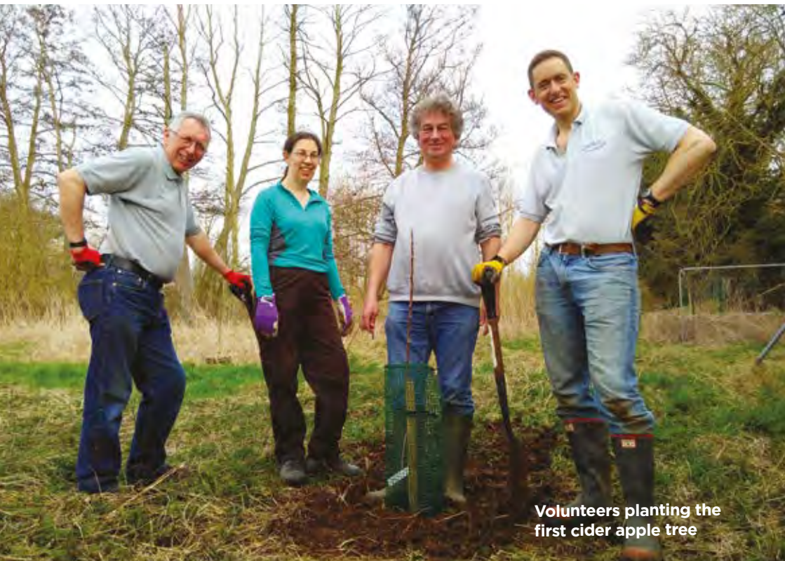
Volunteers planting the first cider apple tree

The Town Council decided early on that part of the site should be planted as a mixed fruit orchard. Volunteers planted the first 21 trees in the winter of 2018 and added to that in 2019. The plan is to plant a further 20 trees this winter, taking the total to 60. We have a good mixture of varieties including pears, cherries, plums, cooking, eating and cider apples, hazel, quince and mulberry. Many are local varieties, but others are the 'best in class' for instance, for making apple sauce, or whose flavour develops with keeping, until they are perfect with cheese on Boxing Day!