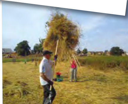
Raking hay in the summer