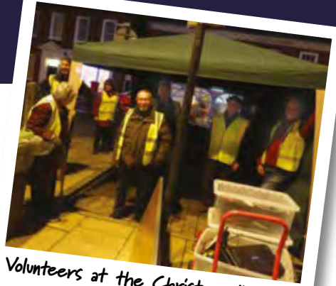
Volunteers at the Christmas lights

Following on from Remembrance Day, our volunteers were hard at work again putting on another fantastic Christmas lights display. The Christmas lights event was very well attended and the lights burned brightly across the festive period prior to their removal in January. They looked fantastic, as they do every year. My thanks again go to all the volunteers who make this possible and help us put up and take down lights along with supporting activities and preparations for the big switch on. Again, we are indebted to Deepdale Trees for contributing the wonderful Christmas trees.