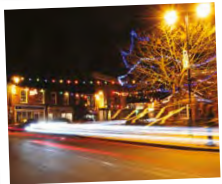
Potton Christmas lights

Finally, before I move on from the subject of Christmas lights, thank you to all the children who entered the Christmas Lights competition. Two of the designs will be made into Christmas Lights for display with all the other lights later this year.