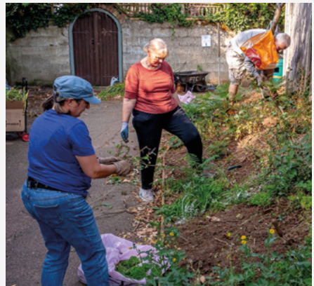
Potton Community Garden volunteers working hard on Meeting Lane