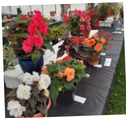
Flower show entries

The 47 th Potton Flower and Vegetable show will be held on Saturday 11 th September 2021 . The show was first held in 1973 and continues to attract competitors from far and wide. The show is held at St. Mary's Church Field on Hatley Road and the many exhibits can be viewed in the marquee from 2pm to 5pm.