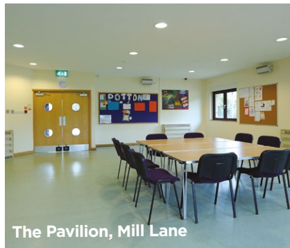
The Pavilion, Mill Lane

For up to date guidance, visit https://www.gov.uk/guidance/covid-19-coronavirus-restrictions-what-you-can-and-cannot-do