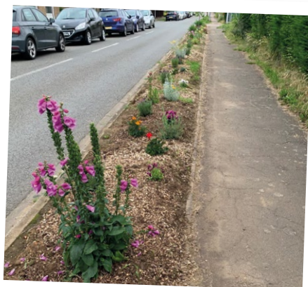
Sutton Mill Road

To talk to the organisers about getting involved with either or both the existing gardens or setting up your own, email the town council with your contact details to express your interest and we will get back to you.