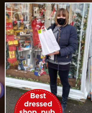
Best dressed shop, pub, business winner