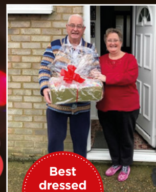
Best dressed home winner