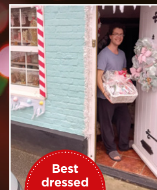
Best dressed window winner