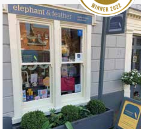
Elephant & Feather