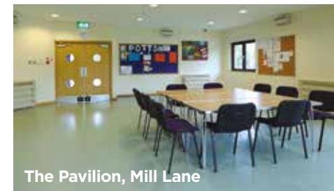
The Pavilion, Mill Lane

You can call the office on 01767 260086 or email us at pottoncouncilbookings@btconnect.com to check availability and make a booking.