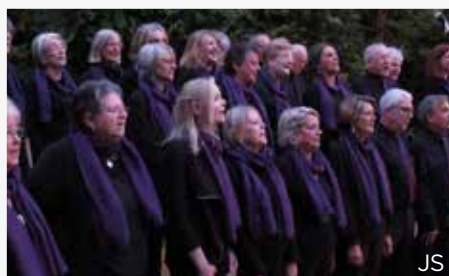
New voices of Potton at the beacon lighting

My thanks also go to New Voices of Potton for singing the Platinum Jubilee song 'A Life Lived With Grace'. This really added to the atmosphere.