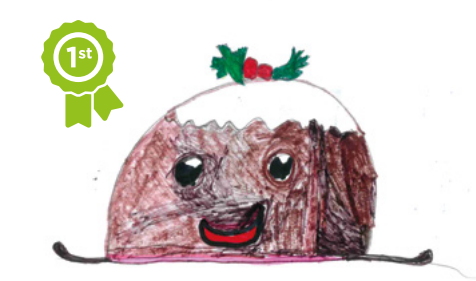
Emilia, age 7