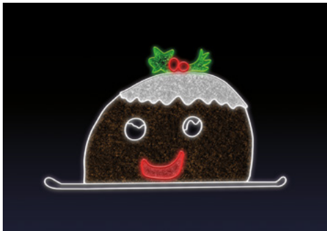
Saoirse, age 9