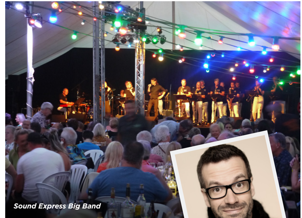
Sound Express Big Band

As ever, the committee would warmly welcome support from volunteers or sponsors. Can you help across the Big Weekend itself and/or at fundraising events or with logistics in the lead up to the main event? If you can, even for a few hours, please email committee@partyonpotton.org.uk with your contact details.