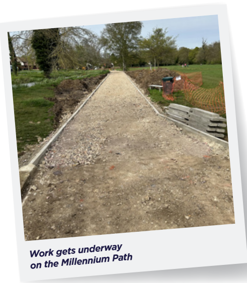
Work gets underway on the Millennium Path

So, spring has come, and much has happened over the past three months. I'll start with the positive things that you may have noticed when you're out and about. The Millennium Path replacement project is well under way and should be finished in good time for the summer events, more of this later. It's looking good and the re-profiled slope has been seeded with a wildflower mix to give a display of meadow flowers for all to enjoy. Please pay heed to any notices asking you to avoid walking over the area so it can establish properly.