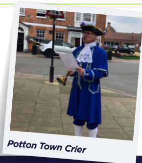
Potton Town Crier

On Monday 6th May, the nation's Town Criers were called upon to mark the First Anniversary of the Coronation of King Charles III and Queen Camilla. Potton's Town Crier, who is a member of the Ancient and Honorary Guild of Town Criers, read the Proclamation on behalf of the town in the Market Square at midday.