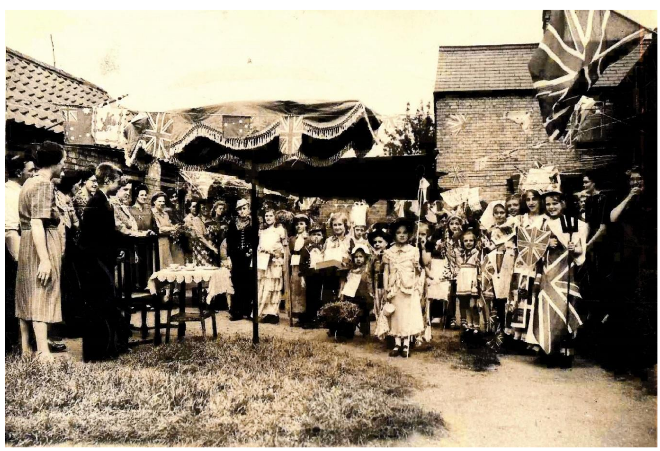
VE Day in Potton, Celebrations in Everton Road 1945